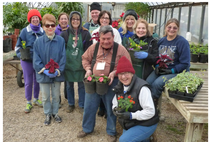
EBR Master Gardeners prepare plants for plant sale.

Plant sale ◀ April 11 ▶ LSU Botanic Gardens at Burden◀ Sponsored by the East Baton Rouge Master Gardeners Plantmakers An annual event, and the only fund-raising activity of the Master Gardeners to support numerous community service and education projects.